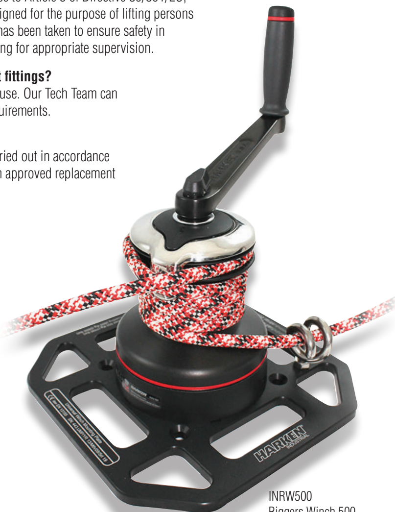
INRW500 Riggers Winch 500

For more information please visit the website, www.harkenindustrial.com or contact us on +44 (0)1590 689122 or info@harkenindustrial.com