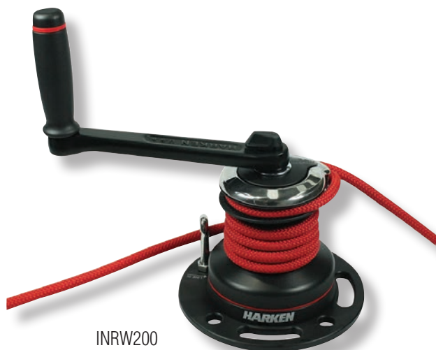
INRW200 Riggers Winch 200

A: Yes; servicing and maintenance of the winch should be carried out in accordance with the Harken service instructions and only using Harken approved replacement parts and consumables.